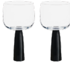
Gin Glasses Black - Set of 2 4x4x7.25" / 17 oz ASD10384