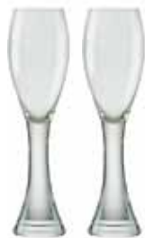
Champagne Flutes - Set of 2