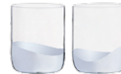
DOF Tumblers Silver - Set of 2 3.25×3.25×3.75" / 13.5 oz ASD10406