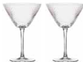
Cocktail Glasses Clear - Set of 2