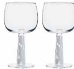
Gin Glasses - Set of 2 3.5×3.5×7.75" / 17 oz ASD10125