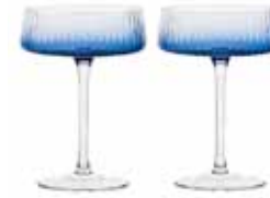
Champagne Coupes Blue - Set of 2 4.25×4.25×6" / 8.5 oz ASD10365