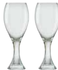
Red Wine Glasses - Set of 2