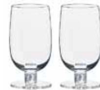
Highball Tumblers - Set of 2 2.75×2.75×6" / 15.25 oz ASD10126