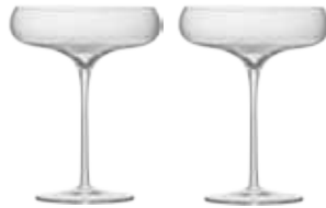
Champagne Coupes - Set of 2 4.75x4.75x6.25" / 10oz ASD10417