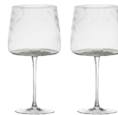
Gin Glasses Clear - Set of 2