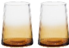
DOF Tumblers Amber - Set of 2