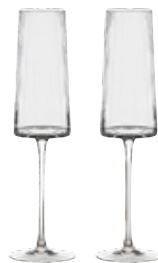
Champagne Flutes Clear - Set of 2