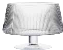
Trifle Bowl Clear 9.5×9.5×7" / 133.75 oz ASD10318