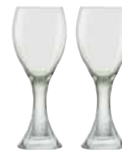
White Wine Glasses - Set of 2