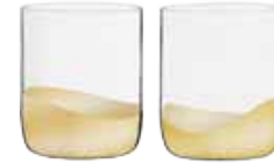
DOF Tumblers Gold - Set of 2 3.25×3.25×3.75" / 13.5 oz ASD10399