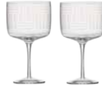
Gin Glasses - Set of 2 4×4×6.75" / 15.25oz ASD10196