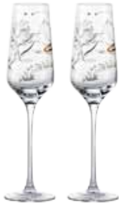
Champagne Flutes - Set of 2 2.5x2.5x9.75" / 8.5 oz ASD10074