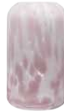
Pink Vase Small 5×5×8.25" ASD10285