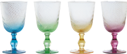
Wine Glasses - Set of 4 3.5x3.5x6.75" / 15.25 oz ASD10004