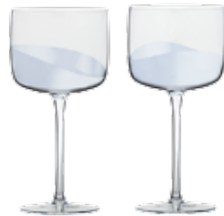
Gin Glasses Silver - Set of 2 3.75×3.75×7.75" / 18.5 oz ASD10404