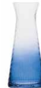
Water Carafe Blue 4.25×4.25×9.75" / 40.5 oz ASD10368