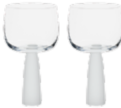
Gin Glasses Frost - Set of 2 4x4x7.25" / 17 oz ASD10392