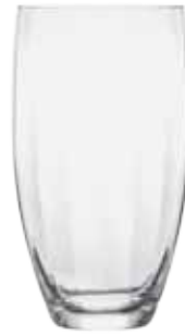
Hampton Vase 5.75×5.75×10.75" ASD10234