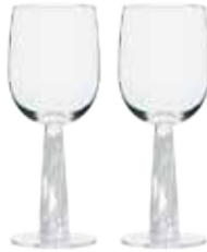
Wine Glasses - Set of 2 2.75×2.75×8" / 13.5 oz ASD10124