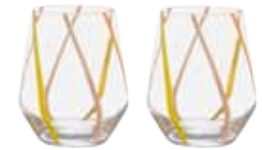
DOF Tumblers / Stemless Wine Glasses Citrus - Set of 2 3.5x3.5x4.25" / 15.25oz ASD10217