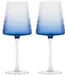
Wine Classes Blue - Set of 2 3.75×3.75×8.75" / 15 oz ASD10363