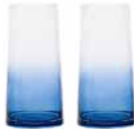
Highball Tumblers Blue - Set of 2 3×3×6.25" / 18.5 oz ASD10366