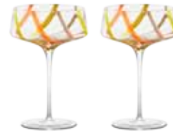
Champagne Coupes Citrus - Set of 2 4.25x4.25x6" / 10oz ASD10216