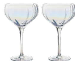
Champagne Coupes - Set of 2