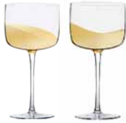
Gin Glasses Gold - Set of 2 3.75×3.75×7.75" / 18.5 oz ASD10397