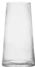
Clear Vase Large 6×6×11" ASD10357