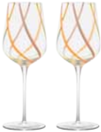
Wine Glasses Citrus - Set of 2 3.25x3.25x9.25" / 15.25oz ASD10214