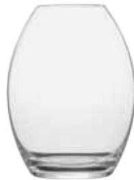
Highbury Vase Large 7.25×7.25×9.25" ASD10227