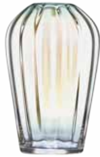
Aura Vase 7×7×10.75" ASD10224