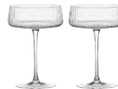
Champagne Coupes Clear - Set of 2