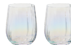
DOF Tumblers / Stemless Wine Glasses - Set of 2