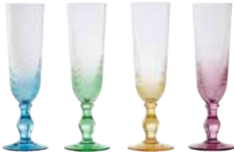
Champagne Flutes - Set of 4 2.25x2.25x8.5" / 8.5 oz ASD10003