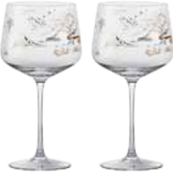
Gin Glasses - Set of 2 4.25x4.25x8.5" / 23.75 oz ASD10076