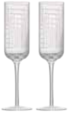
Champagne Flutes - Set of 2 2.25×2.25×8.25" / 6.75oz ASD10194