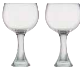
Gin Glasses - Set of 2