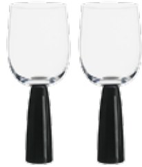
Wine Glasses Black - Set of 2 3x3x8" / 10.25 oz ASD10383