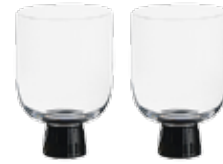
DOF Tumblers Black - Set of 2 3x3x4.5" / 10.25 oz ASD10385