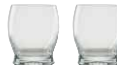
DOF Tumblers - Set of 2