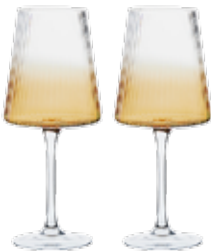
Wine Glasses Amber - Set of 2