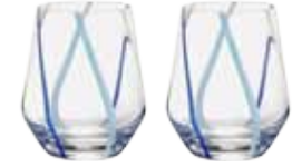
DOF Tumblers / Stemless Wine Glasses Azure - Set of 2 3.5x3.5x4.25" / 15.25oz ASD10207