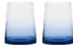
DOF Tumblers Blue - Set of 2 3.25×3.25×4.25" / 13.5 oz ASD10367