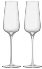
Champagne Flutes - Set of 2 2.25x2.25x9.5" / 8.5oz ASD10413