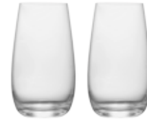
Highball Tumblers - Set of 2 3.25x3.25x5.75" / 18.5oz ASD10418