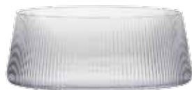
Salad Bowl Clear 10.25×10.25×3.75" / 130.25 oz ASD10319