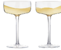
Champagne Coupes Gold - Set of 2 4×4×6.5" / 8.5 oz ASD10398