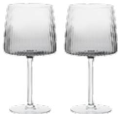
Gin Glasses Smoke - Set of 2