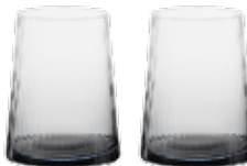
DOF Tumblers Smoke - Set of 2