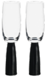
Champagne Flutes Black - Set of 2 2.25x2.25x8.5" / 6.75 oz ASD10382