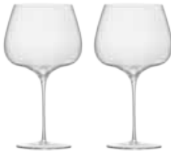
Gin Glasses - Set of 2 4.5x4.5x7.75" / 23.5oz ASD10416