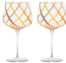
Gin Glasses Citrus - Set of 2 4.5x4.5x8.75" / 23.5oz ASD10215