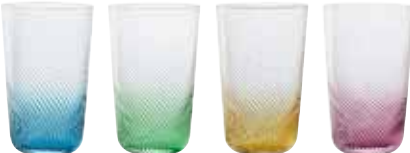
Highball Tumblers - Set of 4 3.5x3.5x5.5" / 18.5 oz ASD10006