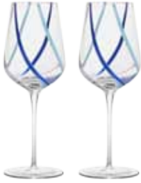
Wine Glasses Azure - Set of 2 3.25x3.25x9.25" / 15.25oz ASD10204