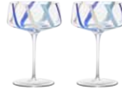
Champagne Coupes Azure - Set of 2 4.25x4.25x6" / 10oz ASD10206