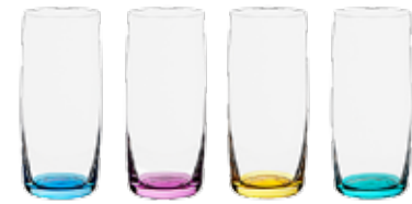
Highball Tumblers - Set of 4 2.25x2.25x5.75" / 11.75 oz ASD10101