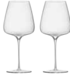
Red Wine Glasses - Set of 2 4x4x8.75" / 20.25oz ASD10414