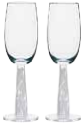
Champagne Flutes - Set of 2 2×2×8.5" / 10 oz ASD10123