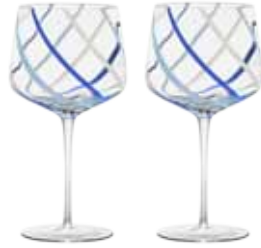
Gin Glasses Azure - Set of 2 4.5x4.5x8.75" / 23.5oz ASD10205