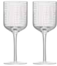
Wine Glasses - Set of 2 3×3×7" / 8.5oz ASD10195