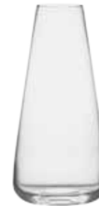
York Vase Large 4.75×4.75×9.75" ASD10229