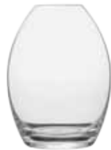
Highbury Vase Small 6×6×7.75" ASD10226