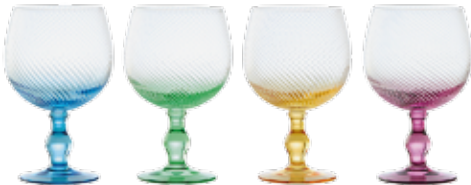
Gin Glasses - Set of 4 4.75x4.75x6.75" / 23.75 oz ASD10005