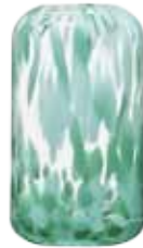
Green Vase Small 5×5×8.25" ASD10284