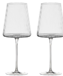
Wine Glasses Clear - Set of 2