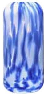
Blue Vase Large 5×5×10.75" ASD10286