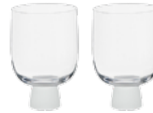
DOF Tumblers Frost - Set of 2 3x3x4.5" / 10.25 oz ASD10393