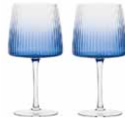
Gin Glasses Blue - Set of 2 4.25×4.25×8.25" / 23.5 oz ASD10364