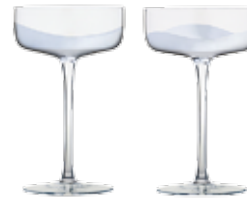
Champagne Coupes Silver - Set of 2 4×4×6.5" / 8.5 oz ASD10405