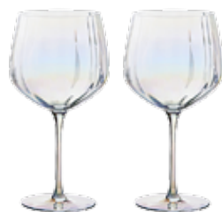
Gin Glasses - Set of 2