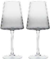
Wine Glasses Smoke - Set of 2