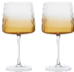
Gin Glasses Amber - Set of 2