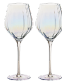
Wine Glasses - Set of 2