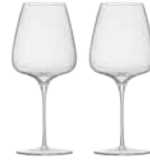
White Wine Glasses - Set of 2 3.5x3.5x8.25" / 15.25oz ASD10415