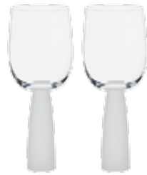
Wine Glasses Frost - Set of 2 3x3x8" / 10.25 oz ASD10391