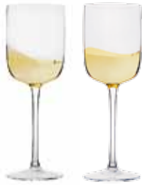
Wine Glasses Gold - Set of 2 3×3×8.5" / 13.5 oz ASD10396