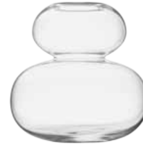
Eclipse Vase 9.75×9.75×9.5" ASD10225