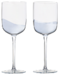
Wine Glasses Silver - Set of 2 3×3×8.5" / 13.5 oz ASD10403