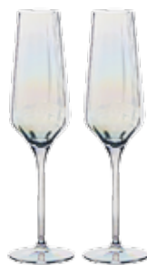
Champagne Flutes - Set of 2