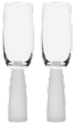
Champagne Flutes Frost - Set of 2 2.25x2.25x8.5" / 6.75 oz ASD10390