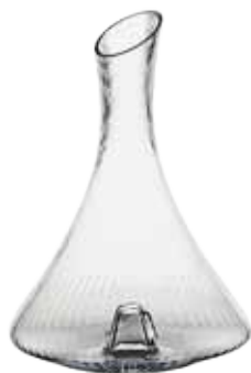
Wine Carafe Clear 7.75×7.75×11.5" / 100 oz ASD10350