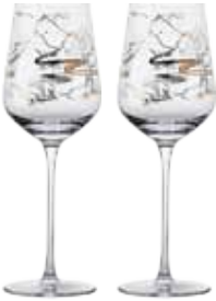
Wine Glasses - Set of 2 3.25x3.25x9.5" / 15.25 oz ASD10075