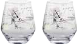
DOF Tumblers / Stemless Wine Glasses - Set of 2 3.5x3.5x4.25" / 17 oz ASD10077