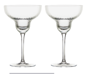
Margarita Glasses Clear – Set of 2 4.5×4.5×7.25" / 13.5 oz ASD10352