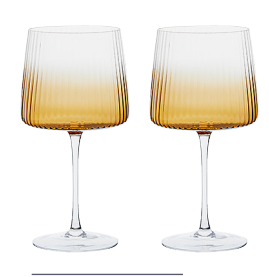
Gin Glasses Amber – Set of 2 4.25×4.25×8.25"/23.5 oz ASD10359