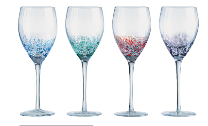
Wine Glasses – Set of 4 3.25×3.25×9"/12 oz ASD10120