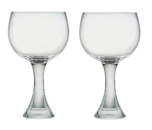
Gin Glasses – Set of 2 4.5×4.5×7.75" / 23.5 oz ASD10279