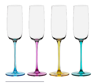
Champagne Flutes – Set of 4 2.25×2.25×9.5"/7 oz ASD10097