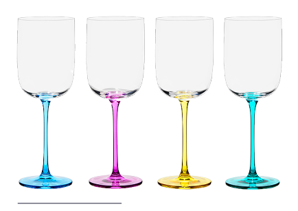
Wine Glasses – Set of 4 3×3×8.5" / 12 oz ASD10098