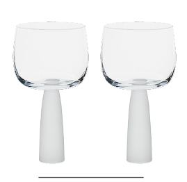
Gin Glasses Frost – Set of 2 4×4×7.25" / 17 oz