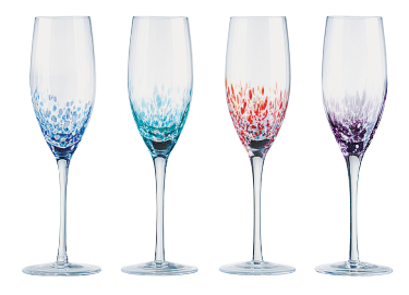
Champagne Flutes – Set of 4 2.25×2.25×9.5"/8.5 oz ASD10119