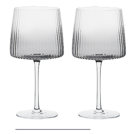
Gin Glasses Smoke – Set of 2 4.25×4.25×8.25" / 23.5 oz ASD10372