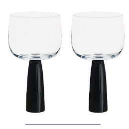
Gin Glasses Black - Set of 2 4×4×7.25" / 17 oz ASD10384