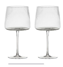
Gin Glasses Clear – Set of 2 4.25×4.25×8.25" / 23.5 oz ASD10346