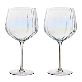
Gin Glasses – Set of 2 4.5×4.5×8.75"/25.5 oz ASD10300