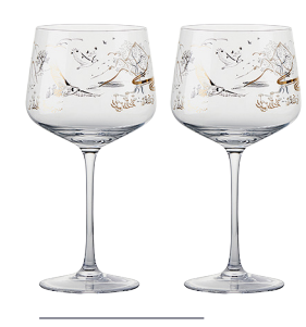
Gin Glasses - Set of 2 4.25×4.25×8.75"/23.5 oz ASD10076