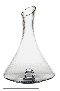
Wine Carafe Clear 7.75×7.75×11.5" / 100 oz ASD10350