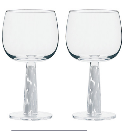
Gin Glass – Set of 2 3.5×3.5×7.75" / 17 oz ASD10125