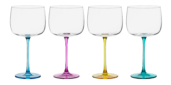
Gin Glasses – Set of 4 4×4×7.5" / 17 oz ASD10099